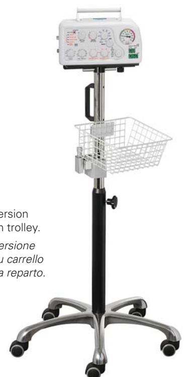
Version on trolley. Versione su carrello da reparto.