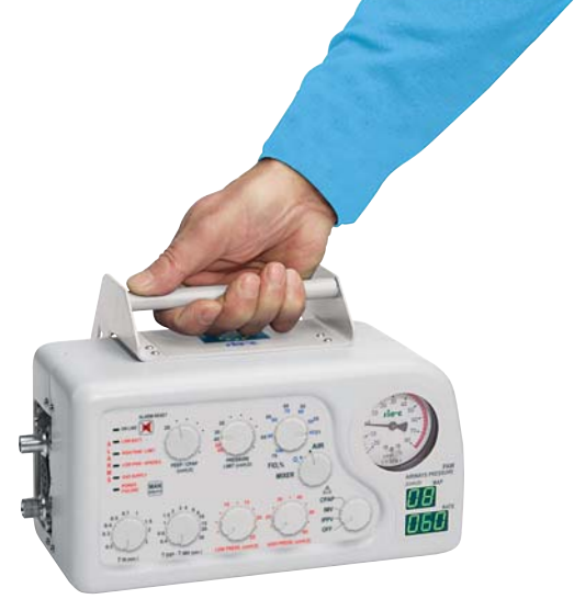
Version for transport. Versione da trasporto.